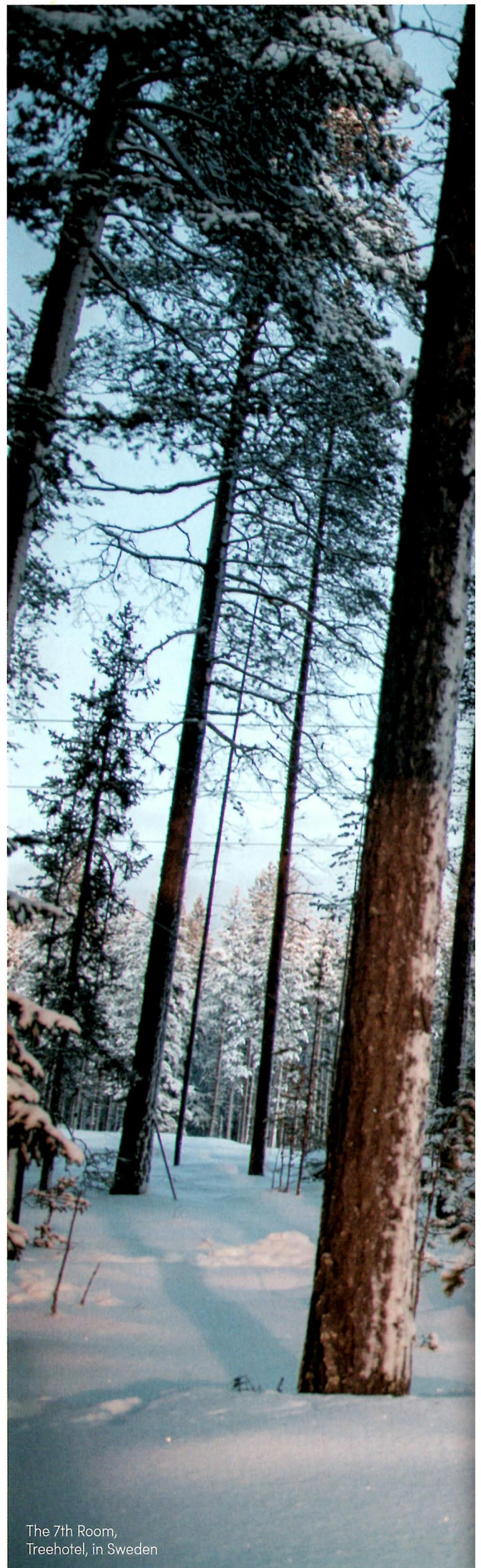
The 7th Room, Treehotel, in Sweden